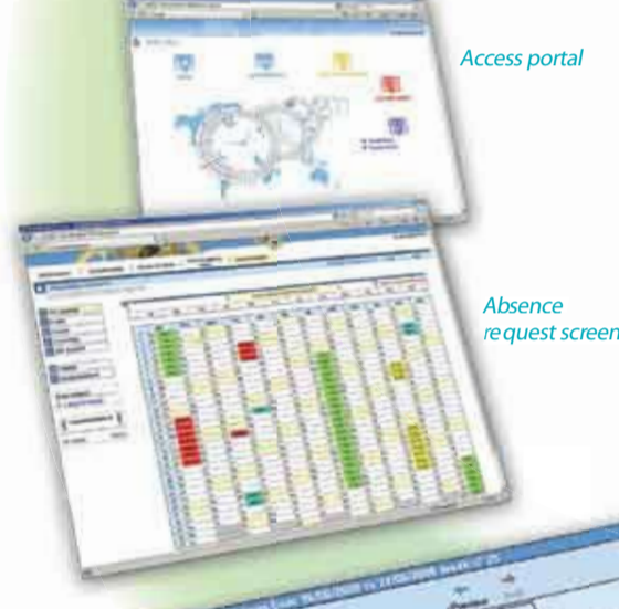
Absence request screen