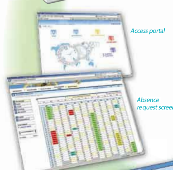
Absence request screen